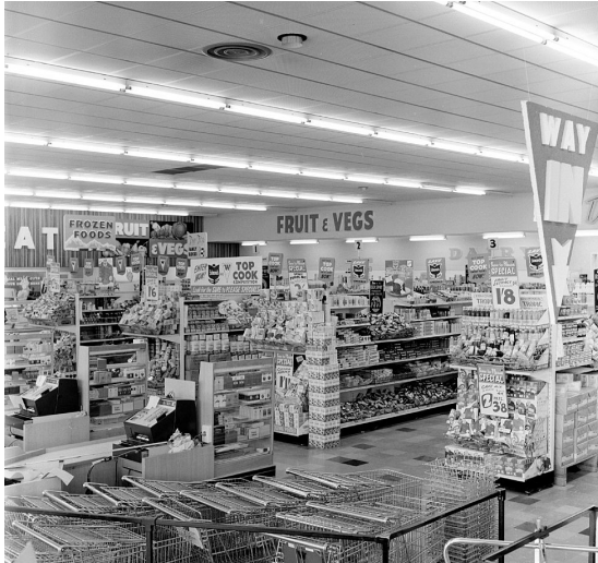
Revelle Jackson, circa 1967