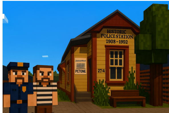
Jackson Street Programme