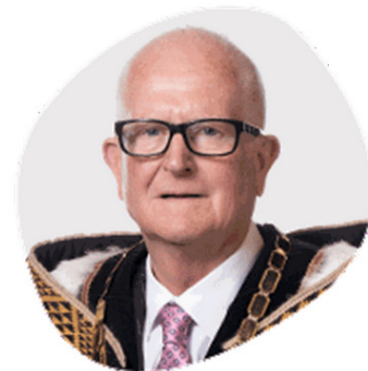
Upper Hutt City Council

"The aim is to develop a water service delivery plan that is workable, financially sustainable, and meets the needs of communities and the environment."