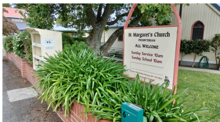
St. Margaret's Presbyterian Church - Silverstream