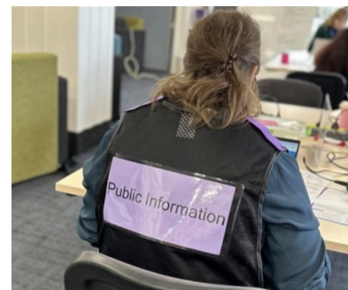
Upper Hutt City Council