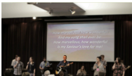
Heretaunga Community Church